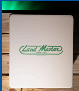
UNIVERSE LAND MASTER TRANSFORMER