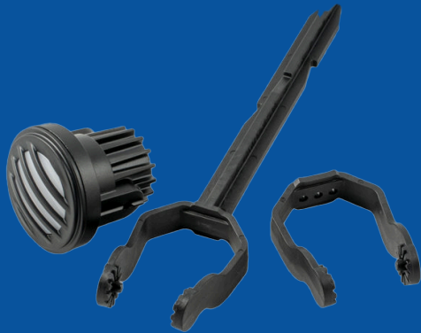
RATCHETING STAKE & BRACKET W/ ENCOMPASS 400